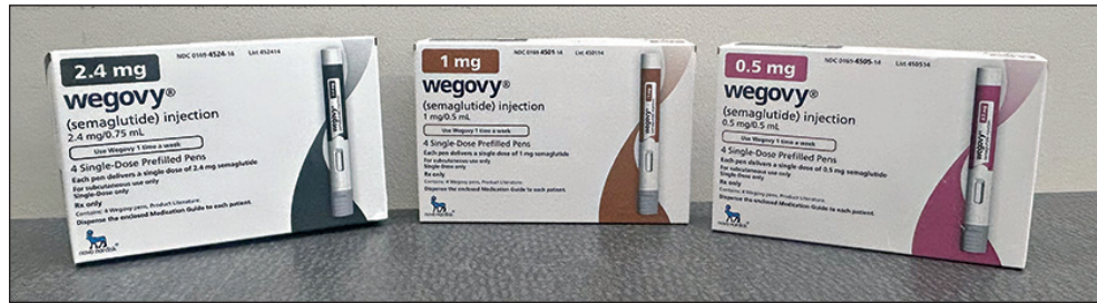
Zack Plair/Dispatch Staff

Shown are three boxes of the Wegovy weight-loss drug Wednesday at an area pharmacy. The FDA in recent years has approved drugs used to treat Type II diabetes to specifically treat weight loss, giving each version a different trade name. For example, Wegovy is the same drug as Ozempic.