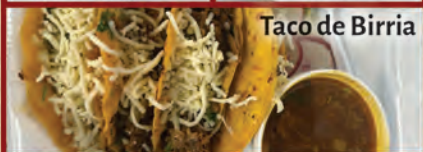
Taco de Birria