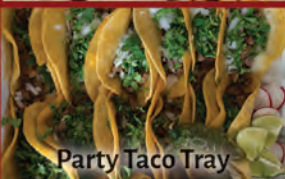
Party Taco Tray