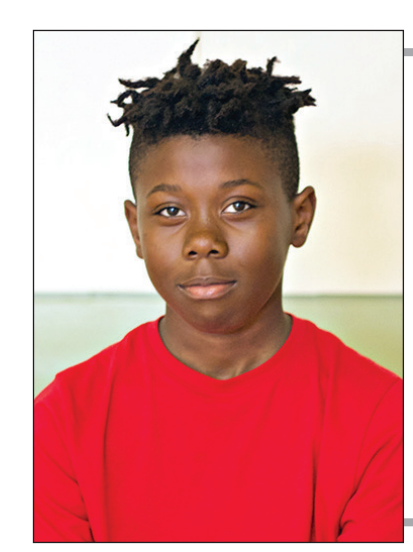
This one time I had to wear these really tacky socks to school."